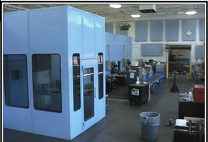
Rigid enclosure used in conjunction with wall absorbers