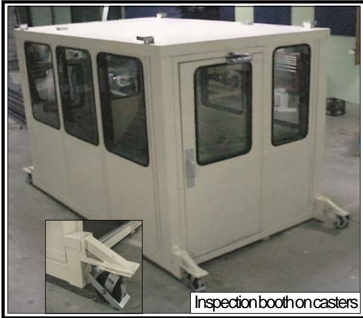
Inspection booth on casters