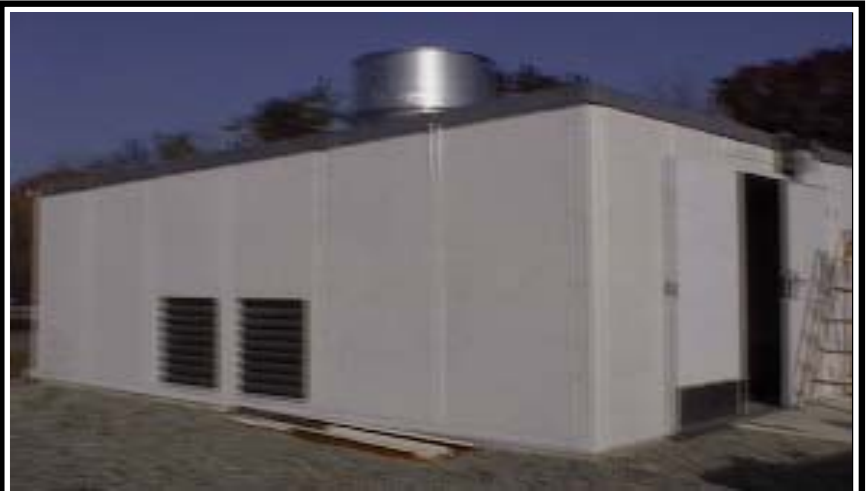
Rooftop Compressor Enclosure

Rigid metal noise control enclosures incorporate an 18 GA solid exterior skin with an 18 GA interior perforated skin, with a 4 lb/cu. ft. density acoustic fill core. Enclosures are designed to both contain and absorb noise, and to act as a barrier between noisy and quiet areas.